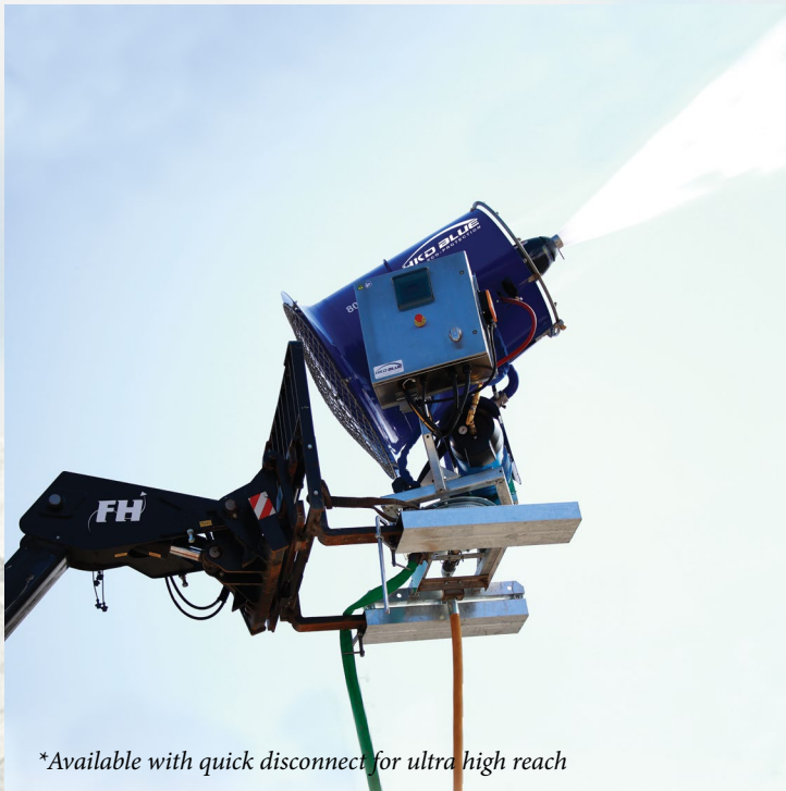
*Available with quick disconnect for ultra high reach